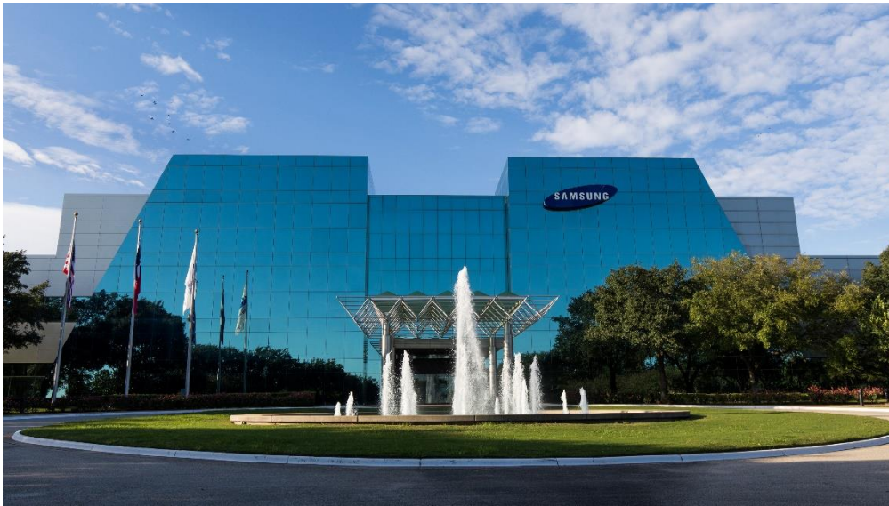
Samsung – Taylor, Texas